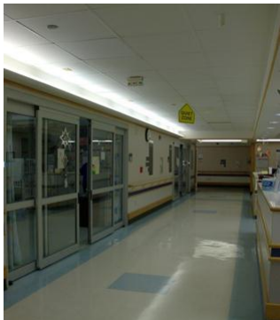
Long hallways connect pods of 6 babies to private rooms that allow parents to connect with their babies as a family